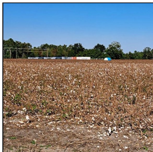
The Park at Satilla will be developed here.